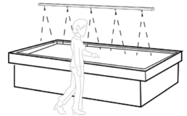
Open displays / Islands

Dimensioning: 2 models according to display area length: